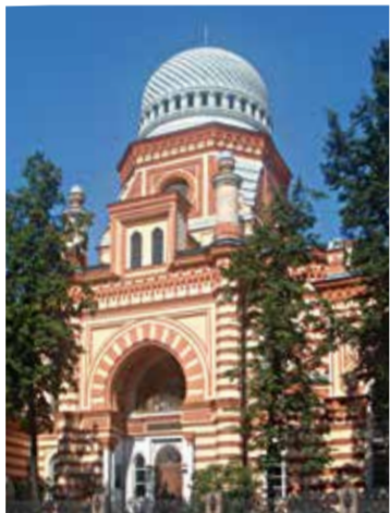
Grand Choral Synagogue of St. Petersburg